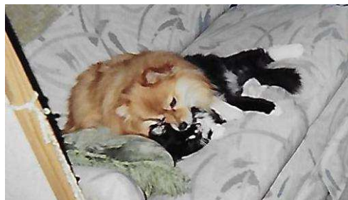
2002, during the move to California. They were tight.