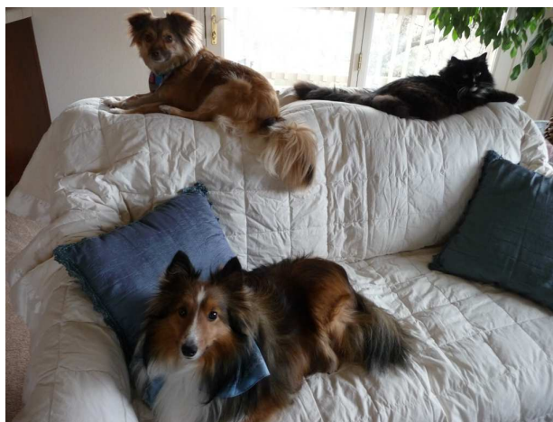
Enter the 3 Amigos