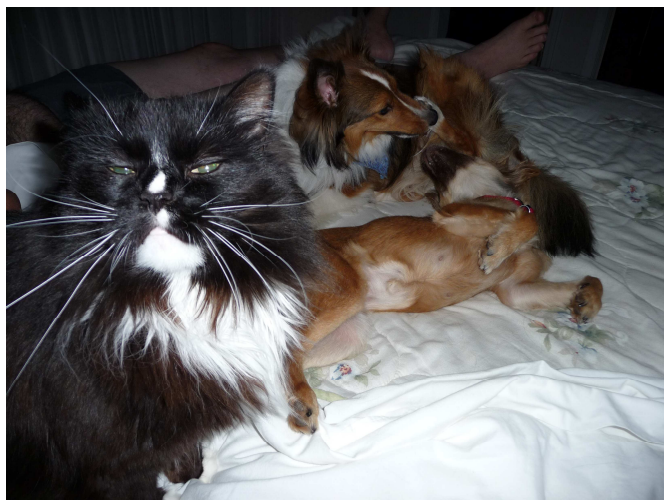
Classic Photobomb, good job Tinkerbell!