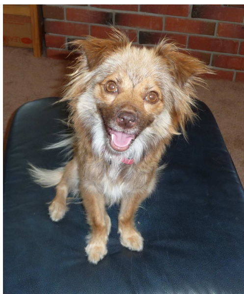
Within a couple of weeks of Bushi Passing all four of us were pining the loss. That's when we rescued this little girl.