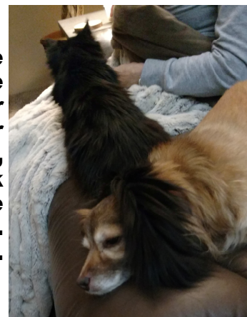
Taken a couple weeks before we had to put her down, while never as playful as Bushi, Gidgyt and Tink were still cuddle buddies to the end. No Pun Intended.