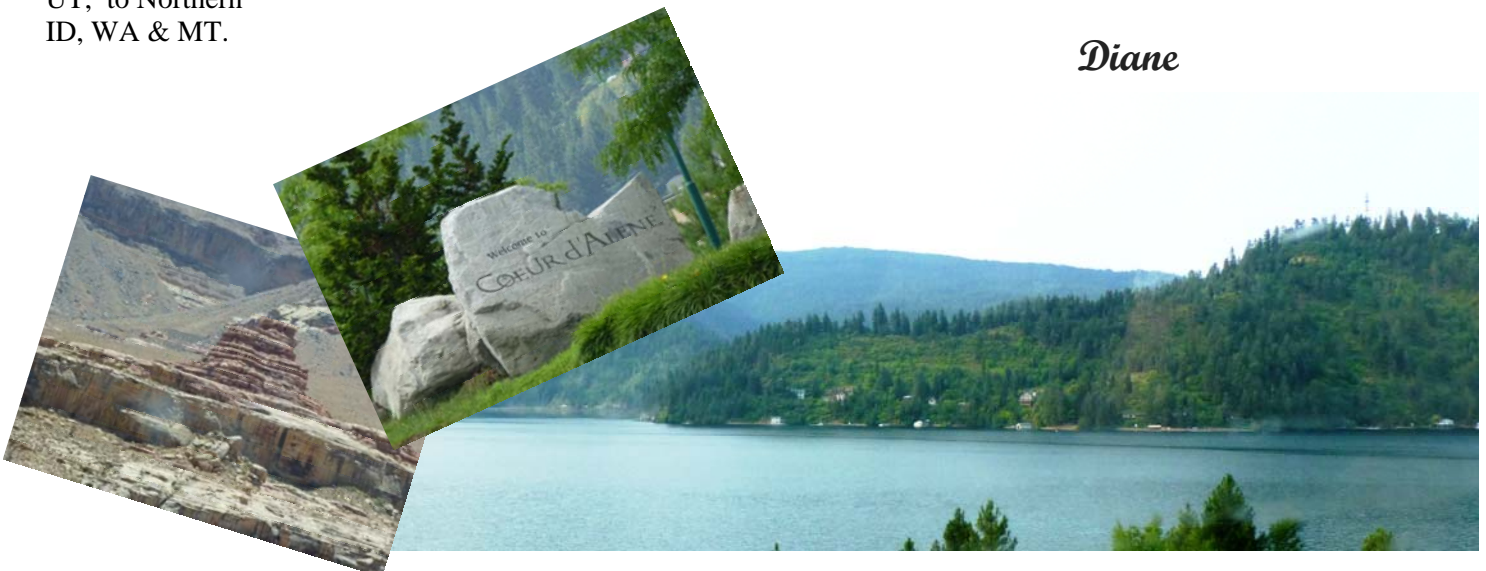
Pictures from our road trip, through NV, UT, to Northern ID, WA & MT.