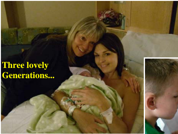
Three lovely Generations...

So why buy that trailer, pull it over 3,900 miles in thirty days, spend lots of money on gas and... Well if a picture is worth a thousand words here's my short answer.