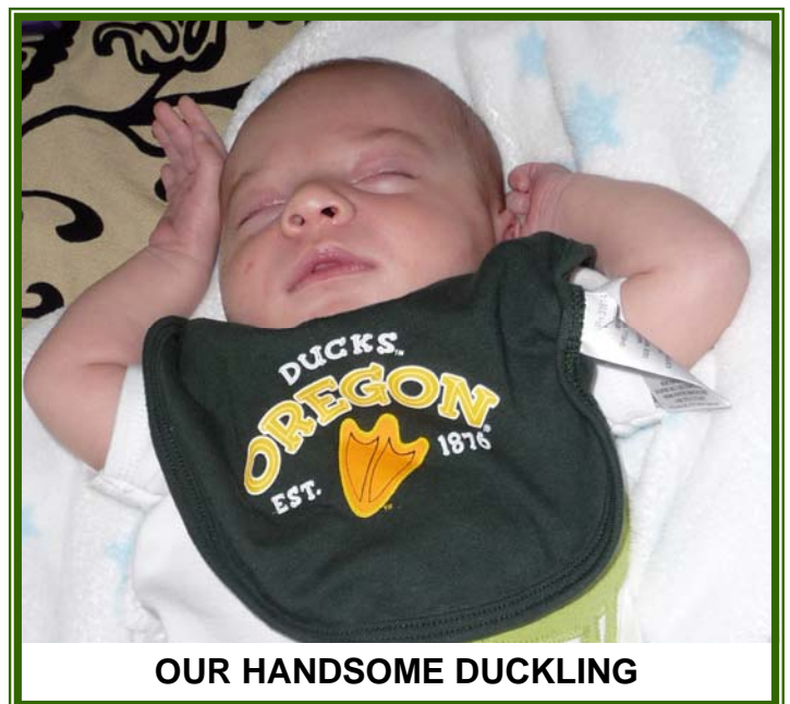
OUR HANDSOME DUCKLING